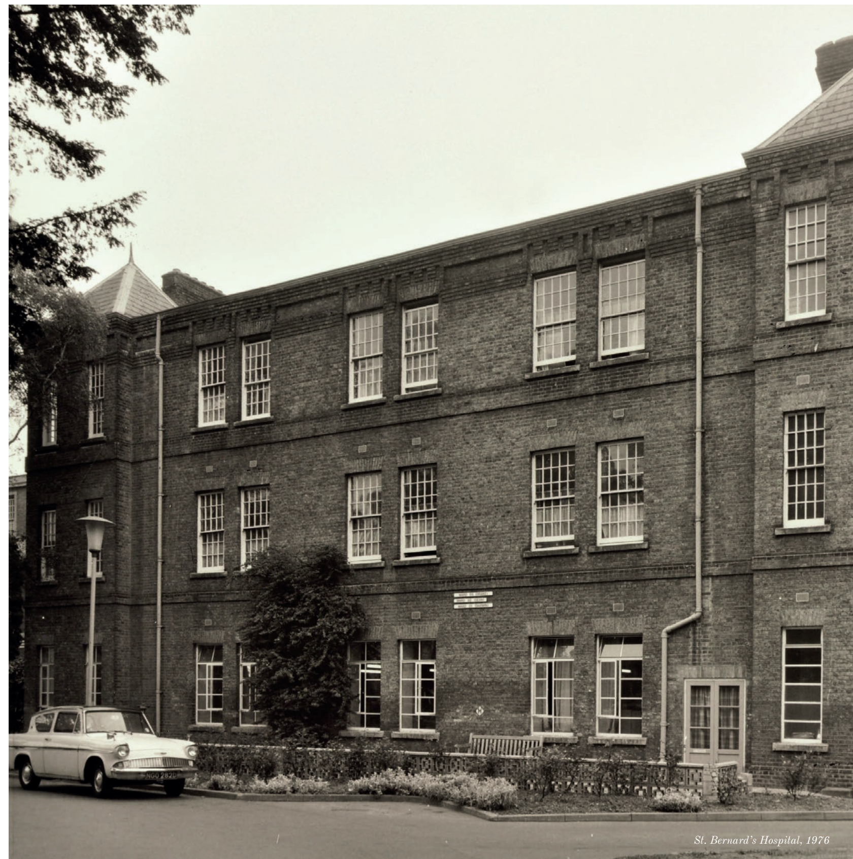
St. Bernard's Hospital, 1976

It became almost entirely autonomous with a farm, laundry, a bakery and, perhaps unwisely, a brewhouse. Local artisans including tailors and shoemakers also combined to create a pioneering, widely self-supporting, regulated community based on humanitarian principles.