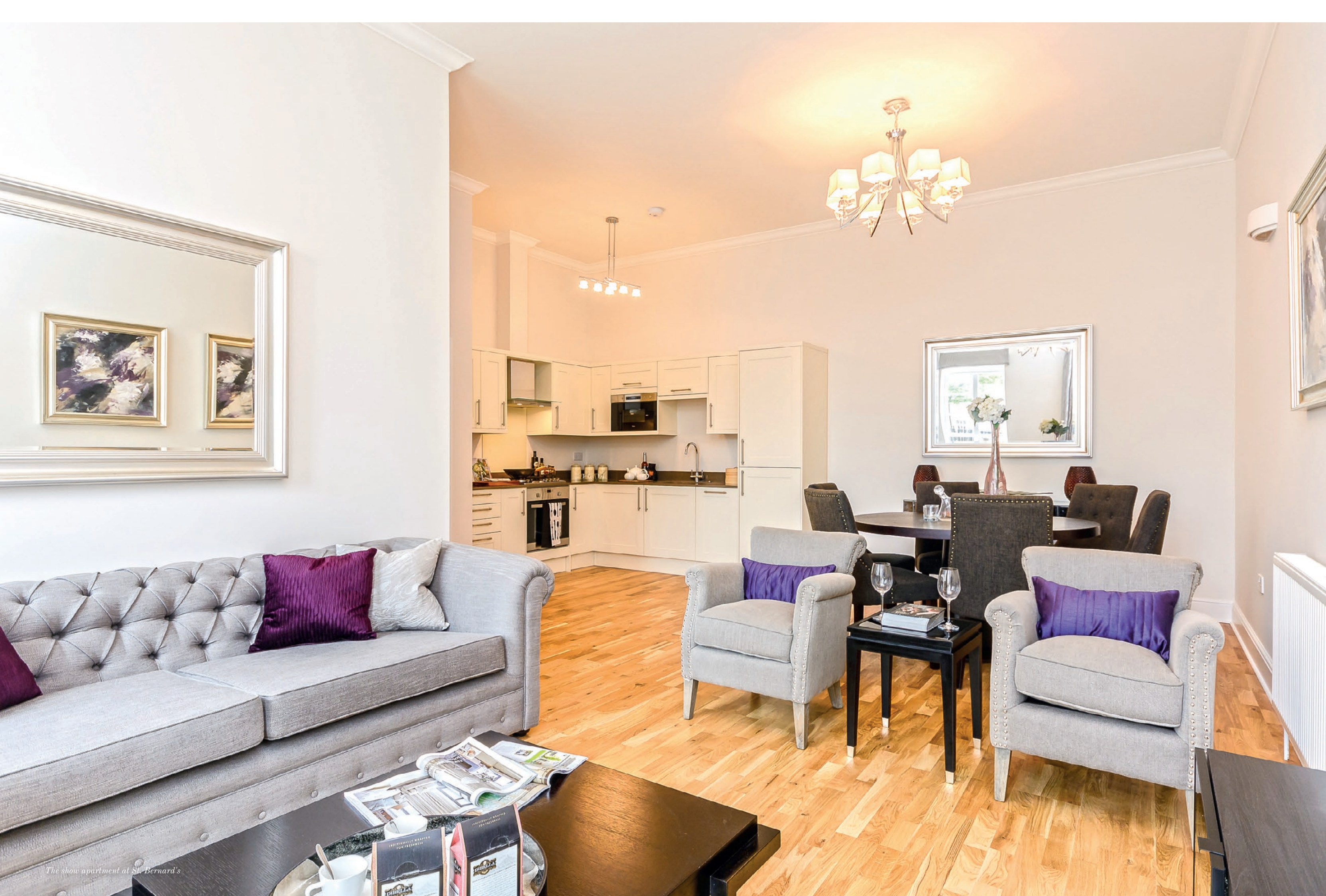
The show apartment at St. Bernard's