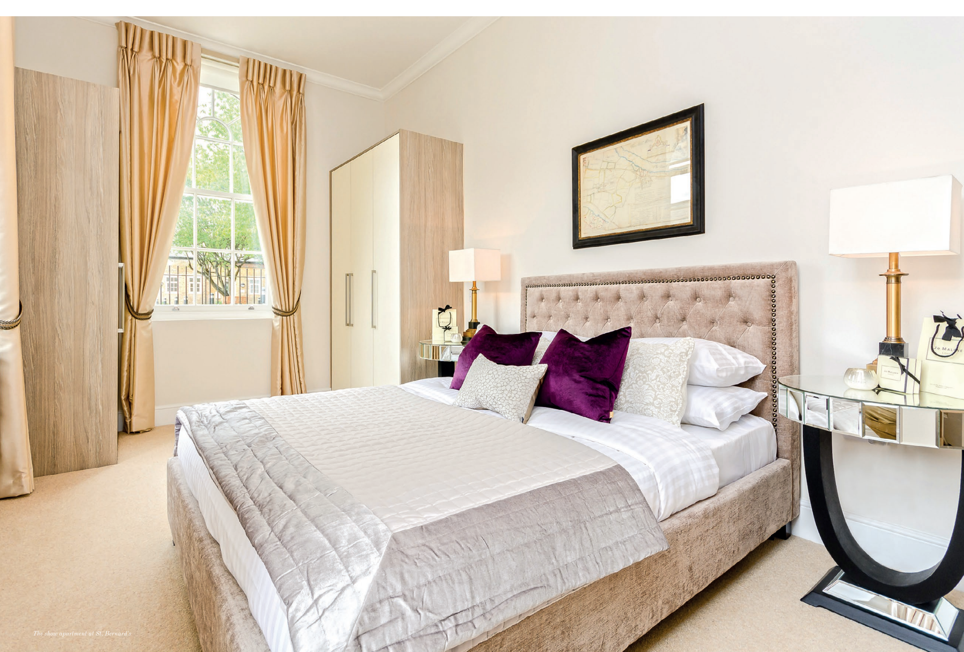
The show apartment at St. Bernard's