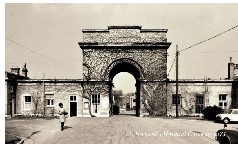
St. Bernard's Hospital Gateway 1971