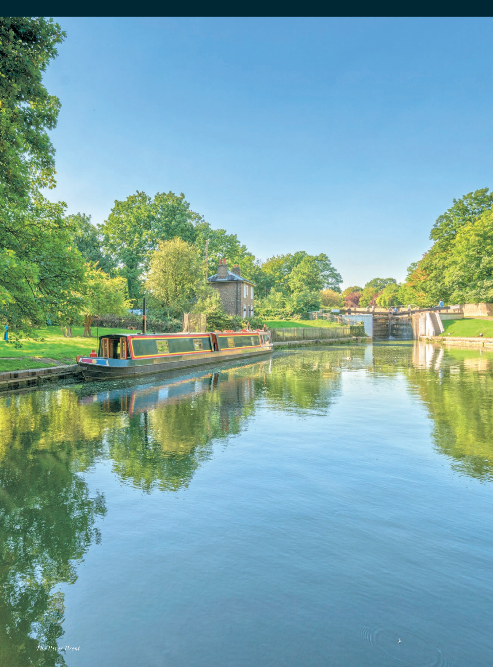
The River Brent