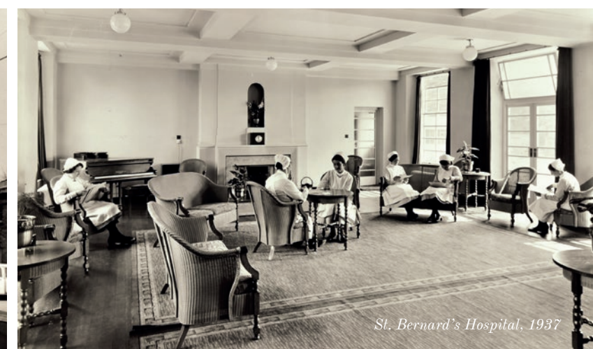
St. Bernard's Hospital, 1937