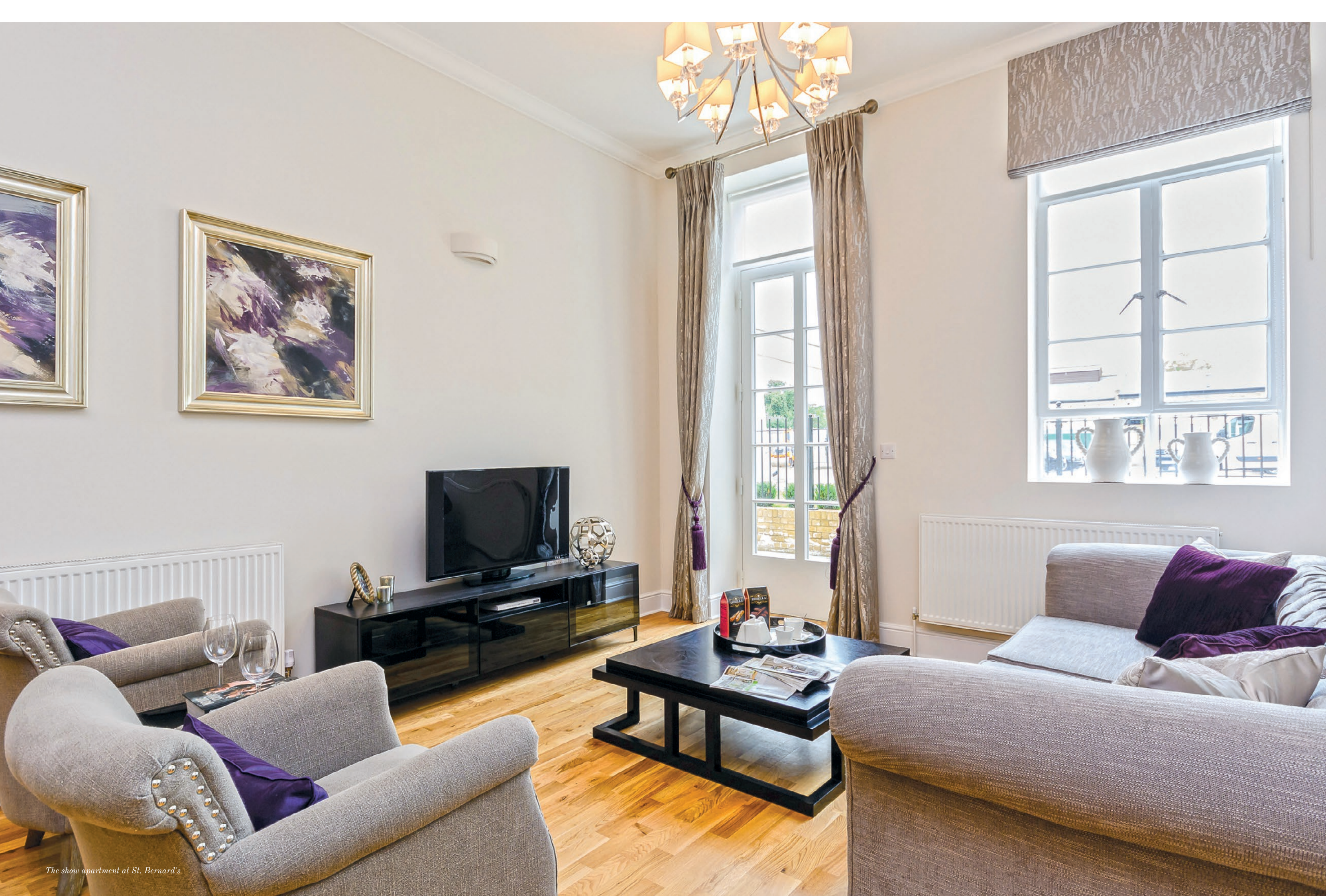
The show apartment at St. Bernard's