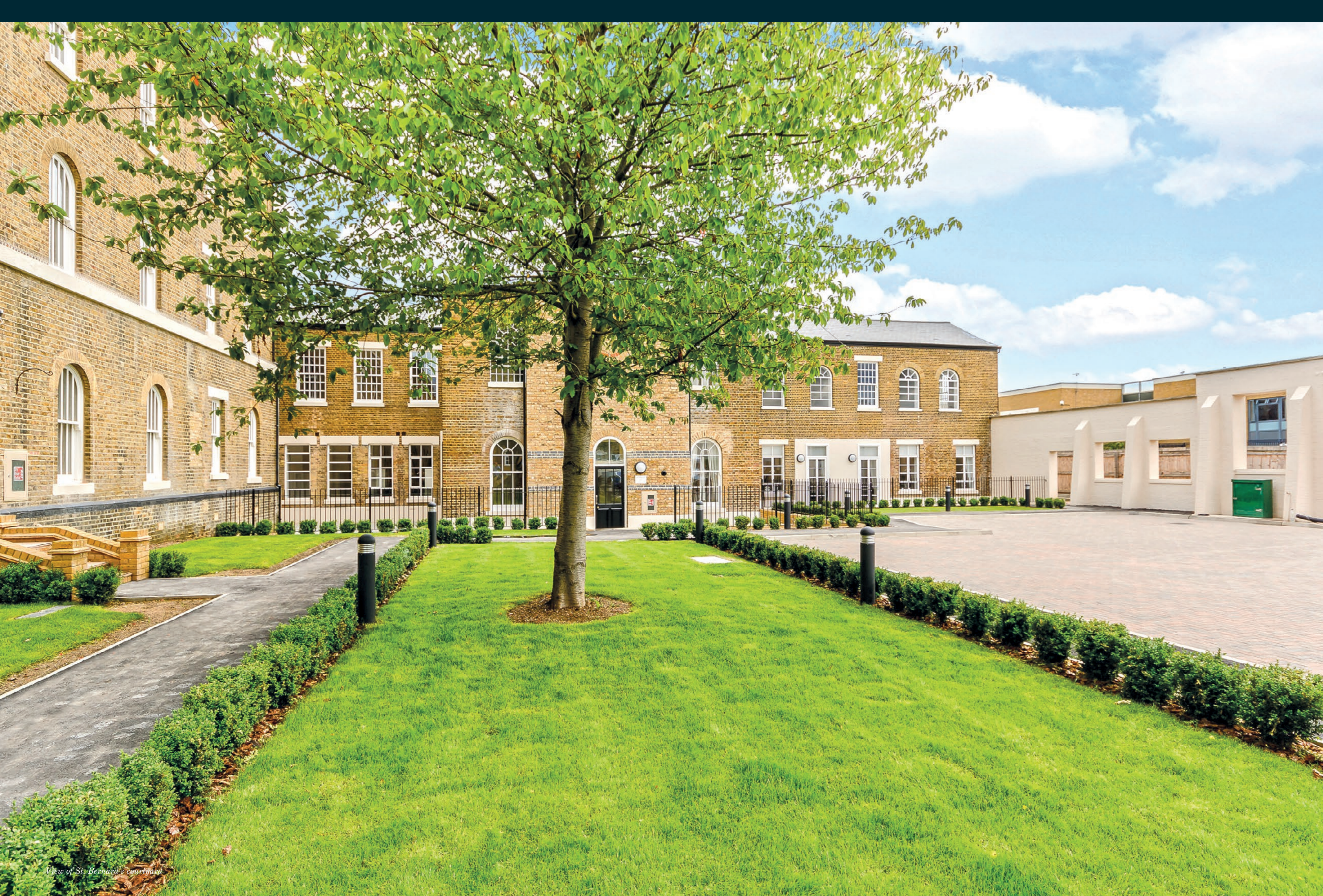
View of St. Bernard's courtyard